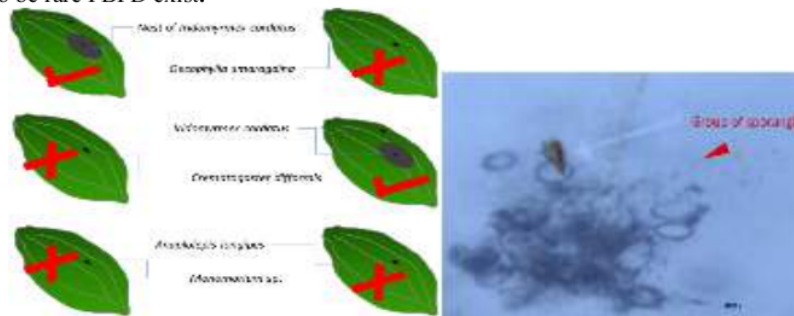
Figure 2. (Left) Testing the presence of P. palmivora obtained from different sources of ant species to assure the role of ant species. (Right) A group of sporangia was obtained from tunnel nest of I. cordatus and identified under microscope 400 x magnification. (✗= absent lesion; ✓ = lesion developed).

The research observation revealed that there were five native ant species colonizing trees in GAPs farm including Iridomyrmex cordatus (local named: fire ant) and Anaplolepis longipes (local: crazy ant), Oecophylla smaragdina (local: weaver ant), Monomorium sp. (local: a giant red ant) and Crematogaster difformis (local: fire ant) and in the farm with poor managing practice there were only two dominant species to colonize the trees; I. cordatus and A. longipes [12, 13, 14]. The observation of PBPD found that intensity of pod damages in unmanaged cocoa farm was likely to be much higher than in GAP farm. In unmanaged cocoa trees, there were lot of fallen leaves, organic matters covered land surface, high dense tree foliage and very rare sunlight exposure to land surface. The findings suggest that inoculum source of PBPD was sufficiently available. Unlikely, good managed farm seemed to be rare PBPD exist.