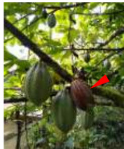
Figure 1. Symptom expression on pod surface. Pod infected by Phytophthora palmivora in the branch far from ground (red arrowhead) with necrotic lesion development.

driven from predatory insect i.e. ant species [9, 10]. Study on the ant species for controlling cocoa pests particularly C. cramerella was vastly undertaken in Malaysia [8, 11]. Several ant species were observed to have potential and found in cocoa agro-ecosystems are cocoa black Ants ( Dolichoderus thoracicus ), weaver ant ( Oecophylla smaragdina ), crazy ant ( Anoplolepis spp) and Saint Valentine ant, ( Crematogaster spp). Among the species, D. thoracicus was proven as a biological control. D. thoracicus is ubiquitous in cocoa-coconut ecosystems and may thrive well due to the availability of nesting sites on the coconut crown. Their population can be increased with the augmentation of artificial ant nest stuffed with dry cocoa leaves.